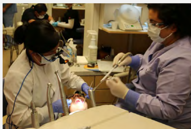
Eighty children were served by Christina's Smile Children's Dental Clinic, a nonprofit dental clinic operated in conjunction with the PGA TOUR. With the annual AT&T Pebble Beach National Pro-Am golf tournament nearby, it made a stop in Salinas.