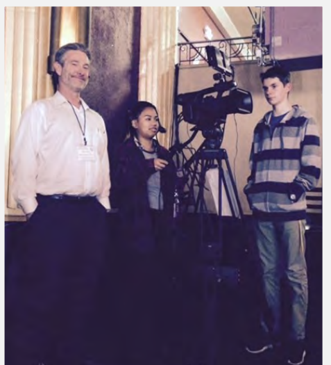
Students from Millennium Charter High School in Salinas provided video services for a 2-day event centered on Arts education. "Create CA" was held January 30-31 at the Oakland School for the Arts.